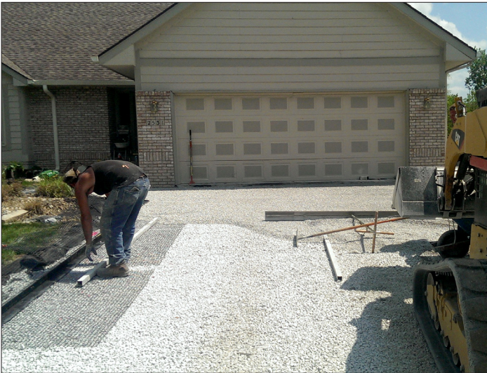
Step 3 Leveling and compacting aggregate