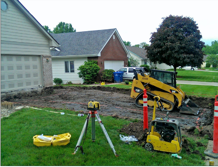
Step 1 Removal of concrete and excavation